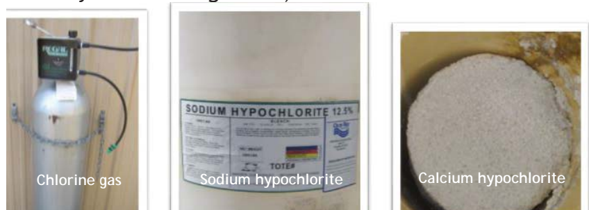
Figure 1. Some example of commercial chlorine options commonly used in greenhouses.

Chlorine is applied as liquid (hypochlorous acid or sodium hypochlorite), solid (calcium hypochlorite, or gas (figure 1). Electrochemically activated water (also known as electrolyzed oxidizing water) also results in the formation