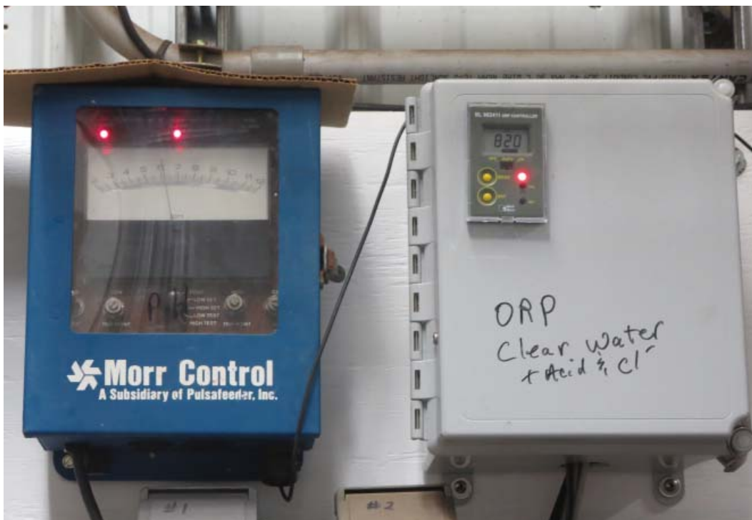
Figure 3. Example of an inline automated pH (left) and ORP (right) meter in a commercial greenhouse.

Combined measurement and control of pH, ORP, and active ingredient concentration provide the most efficient, reliable, and safe chlorination system. Simply ensuring that the pH is under 7.5 prior to injecting chlorine will increase the chlorine efficacy. ORP is easy to measure inline (Figure 3) or with a handheld meter (similar to pH meter). We should aim to have an ORP between 650 to 800 mV. Free chlorine can be measured with the titration meters mentioned earlier.