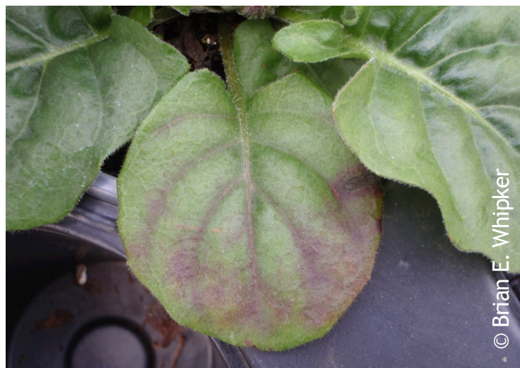
Figure 5. Lower leaves of a gerbera with a purple coloration due to low phosphorus.