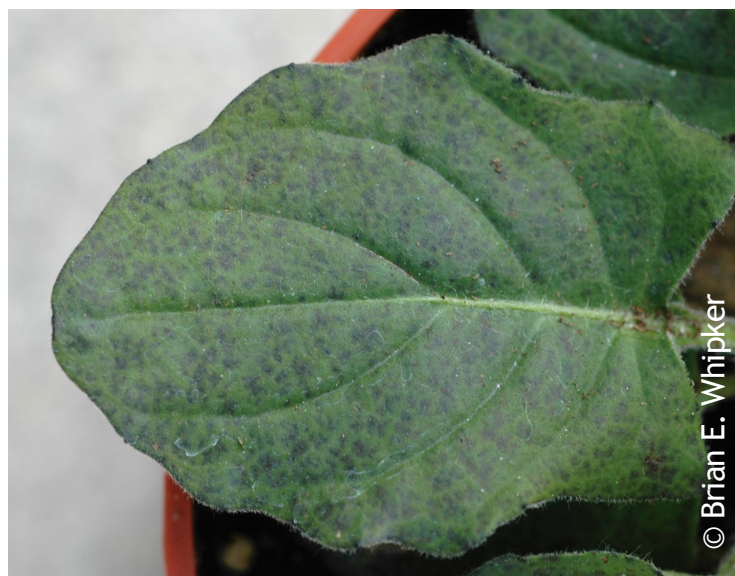
Figure 4. Low pH leads to iron (Fe) and manganese (Mn) toxicity, causing symptoms of dark brown to black spotting.