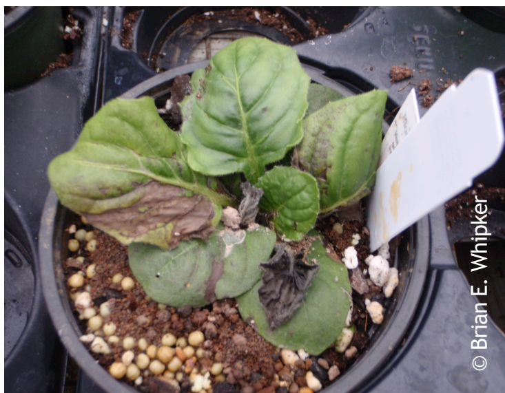
Figure 2. High soluble salts [referred to as electrical conductivity (EC)] due to an over-application of slow release fertilizer can lead to marginal leaf browning and death (necrosis).