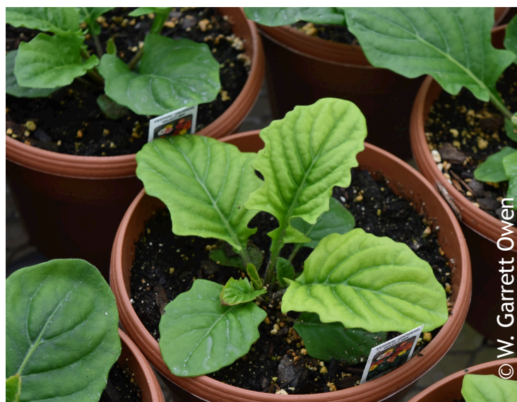
Figure 3. High substrate pH leads to interveinal yellowing (chlorosis) on the upper foliage.