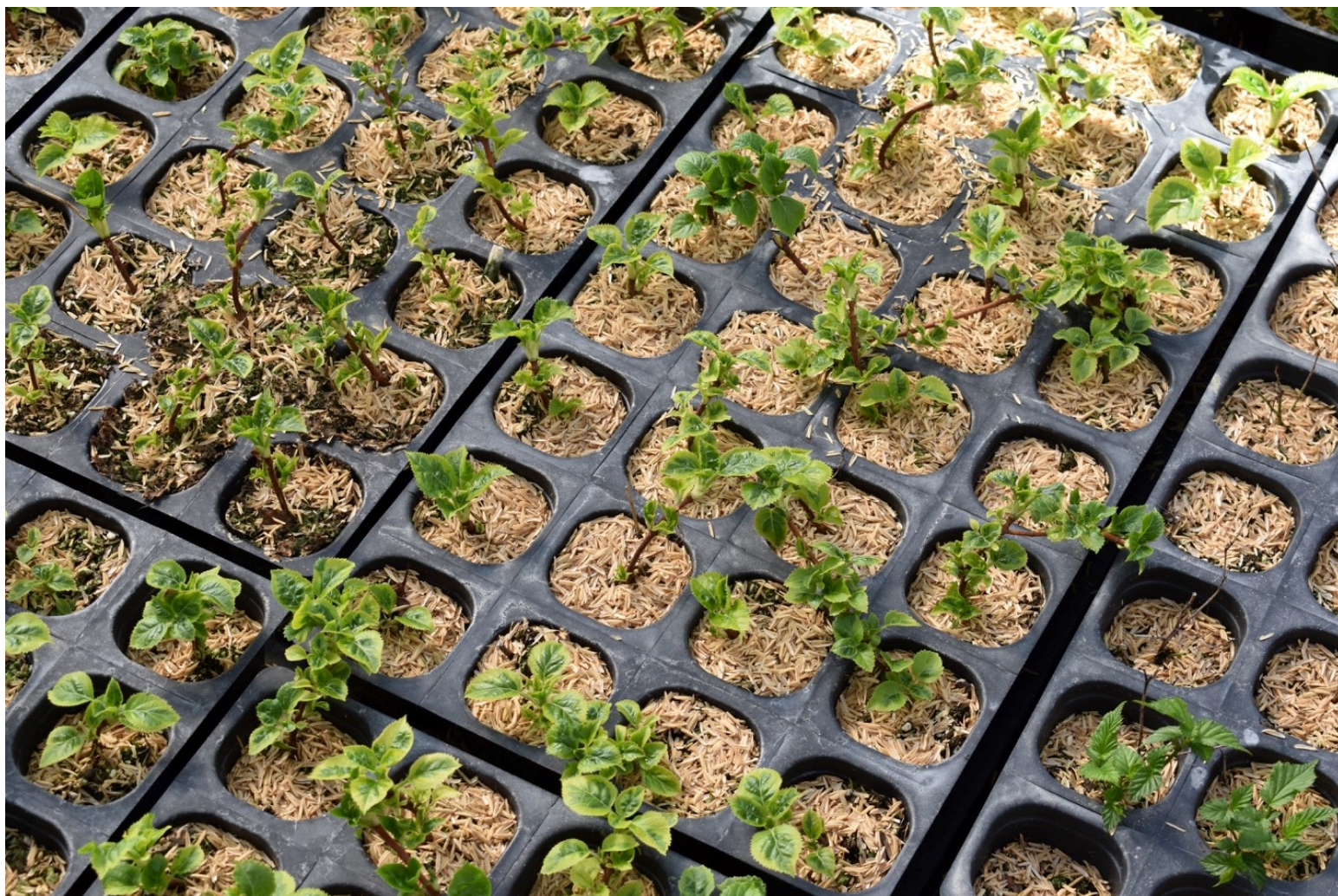
Figure 5. A top-dress of rice hulls reduces liverwort and weeds in nursery production.

When using PBH as a top dress, growers should note that there are a few challenges. Growers report that it is hard to tell if the flats or liners need watering because you can no longer see the surface of the substrate. In addition, if the PBH are applied inconsistently on the surface of a flat or liner, water from overhead irrigation may penetrate some cells and leave others completely dry. Therefore, growers will need to adjust their watering practices and be extra vigilant when starting to use PBH as a top-dress. However, these sacrifices might be a small price to pay for control of weeds, moss, algae, and liverwort.