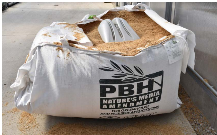
Figure 2. Bulk container of parboiled rice hulls (PBH).

Instead of mixing rice hulls into the substrate, some nursery growers use rice hulls as a top-dress in order to reduce the germination of weed seeds and reduce the incidence of liverwort (Figure 3). Moss, algae, liverwort, and weeds tend to be a major problem in containers with herbaceous perennials or woody plants due to the very long crop time and the damp conditions throughout the dormancy of the plants. Rice hulls work to dry down the surface of the substrate and provide an inhospitable environment for weed seed germination. James Altland (a research horticulturist with the USDA-ARS Application Technology Research Unit in Wooster, Ohio) recently published an article, " USDA tests rice hulls for weed control in container crops " in January 2018 in Nursery Management Magazine . In their experiments, they top-dressed pots with 1, ½, ¼, or 0 inches of PBH in order to control liverwort ( Marchantia polymorpha ) and bittercress ( Cardamine exuosa ). A ½ inch or 1 inch mulch of PBH was 100% percent effective at liverwort and weed control. The ¼ inch mulch provided some suppression but not complete control.