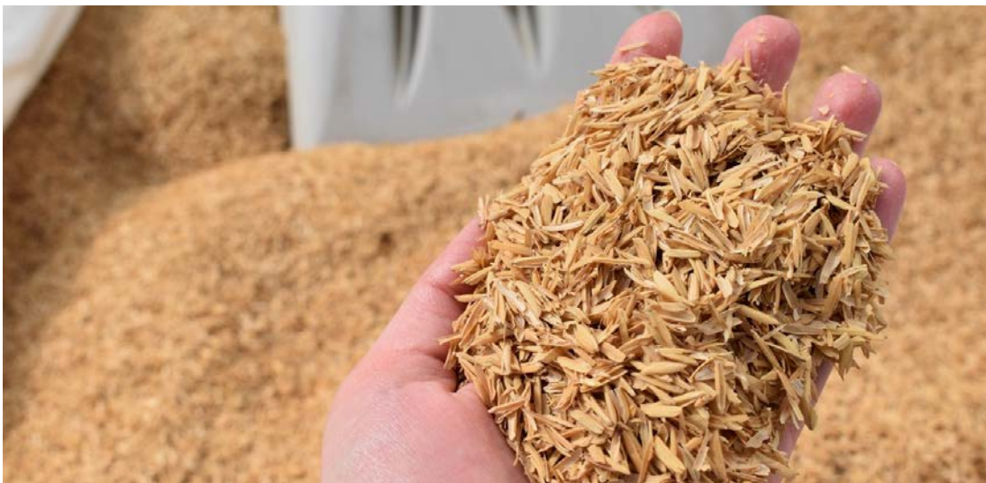
Figure 1. Fresh rice hulls are steamed to produce parboiled rice hulls (PBH) pictured here.

First, what are rice hulls? Rice hulls (or rice husks) is the protective covering of rice (Figure 1). The hulls are a by-product of the rice milling industry. Rice hulls can either be fresh or parboiled. Fresh rice hulls are the direct product after milling rice.