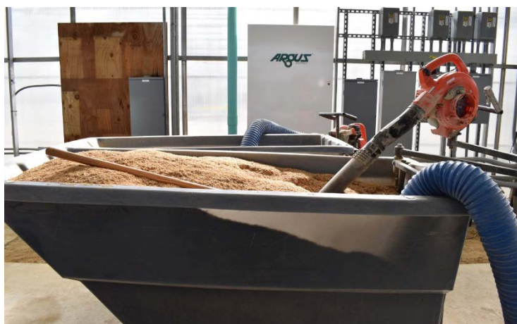
Figure 4. Blower system used by grower to apply parboiled rice hulls as a top-dress in finished production.