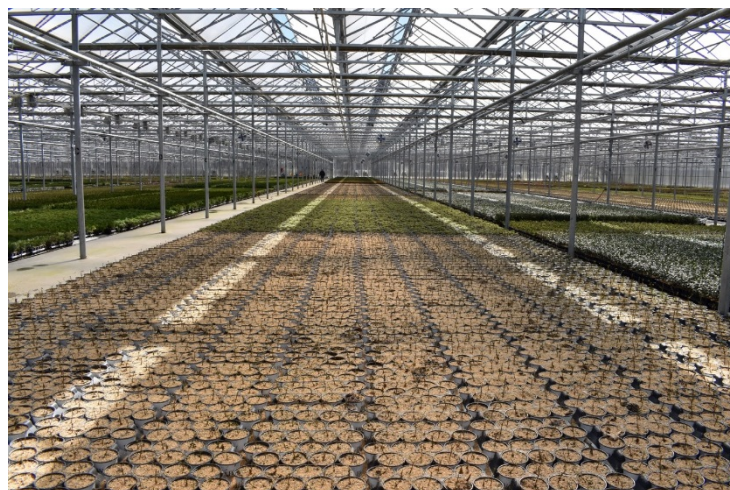
Figure 3. Rice hulls can be used as a top-dress in nursery production to reduce weeds, moss, liverwort, and algae on the growing media surface.