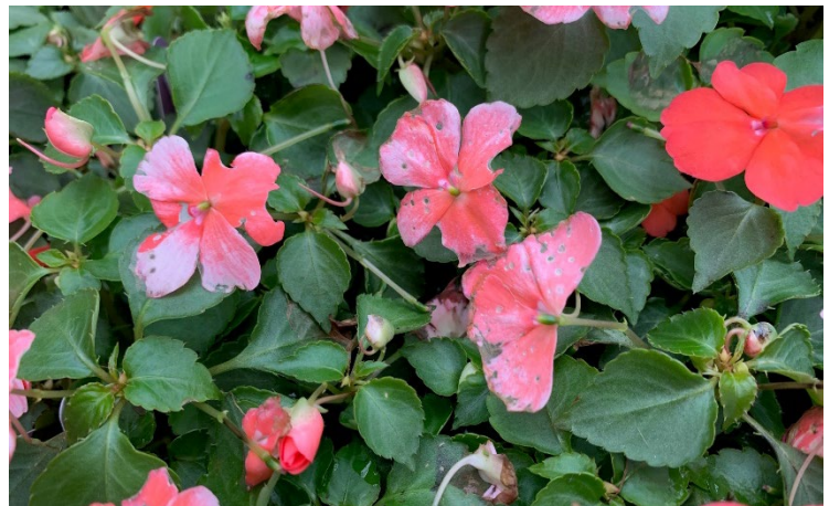
Figure 5: Round, light-colored, translucent spots on Impatiens flowers due to Botrytis infection.