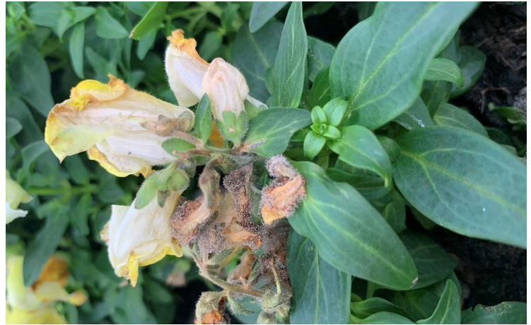
Figure 4: Profuse, grayish sporulation of Botrytis infecting and colonizing snapdragon flowers.

( http://www.e-gro.org/pdf/2019_810.pdf ).