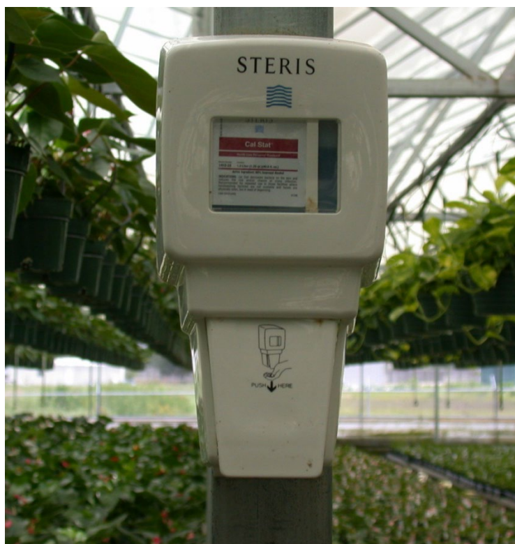
Figure 3: Hand-sanitizing alcohol gel can be used by workers to disinfect their hands after touching or working among bacterial leaf spot infected plants.