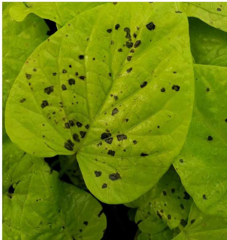
Figure 2: Brown to black, greasy-looking, angular (vein-delimited) bacterial leaf spots on Ipomoea.