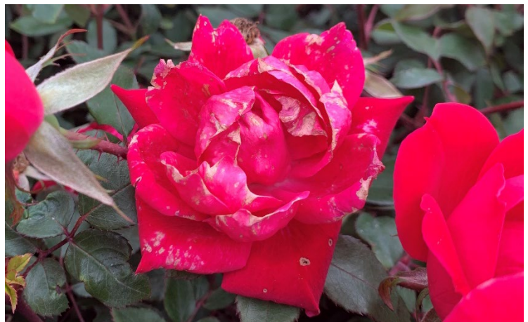
Figure 6: White flecking and blighting of Knock-Out rose flowers due to Botrytis infection. Wet flowers favor infection.