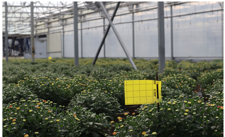
Figure 3. Place cards just above the plant canopy.