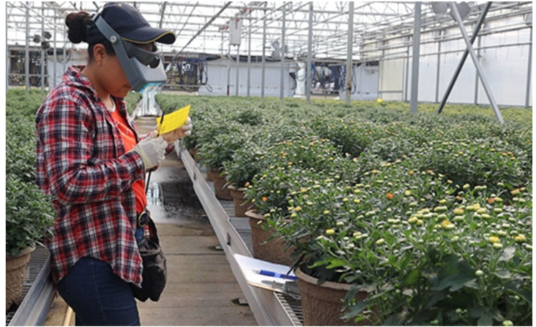
Figure 2. Employee monitoring a sticky card.