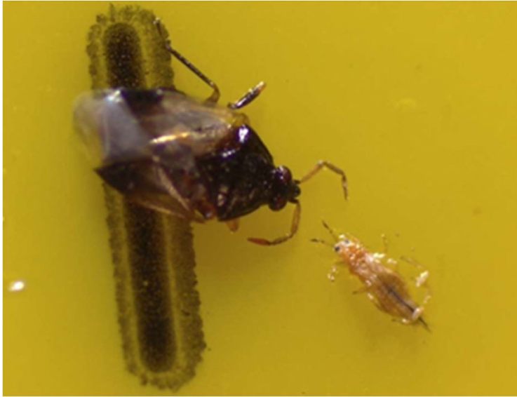
Figure 5. Insidious flower bug trapped on a sticky card.