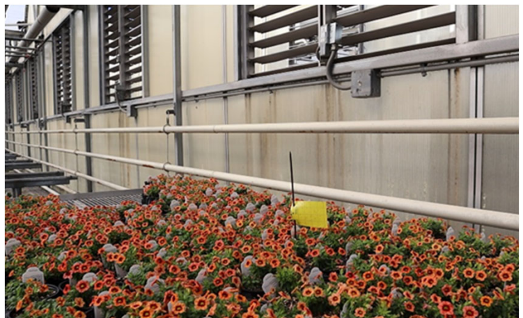
Figure 4. Yellow sticky card near vents.