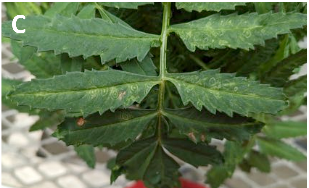
Figure 2. White ringspotting due to a tomato spotted wilt virus (TSWV) infection (A-C).