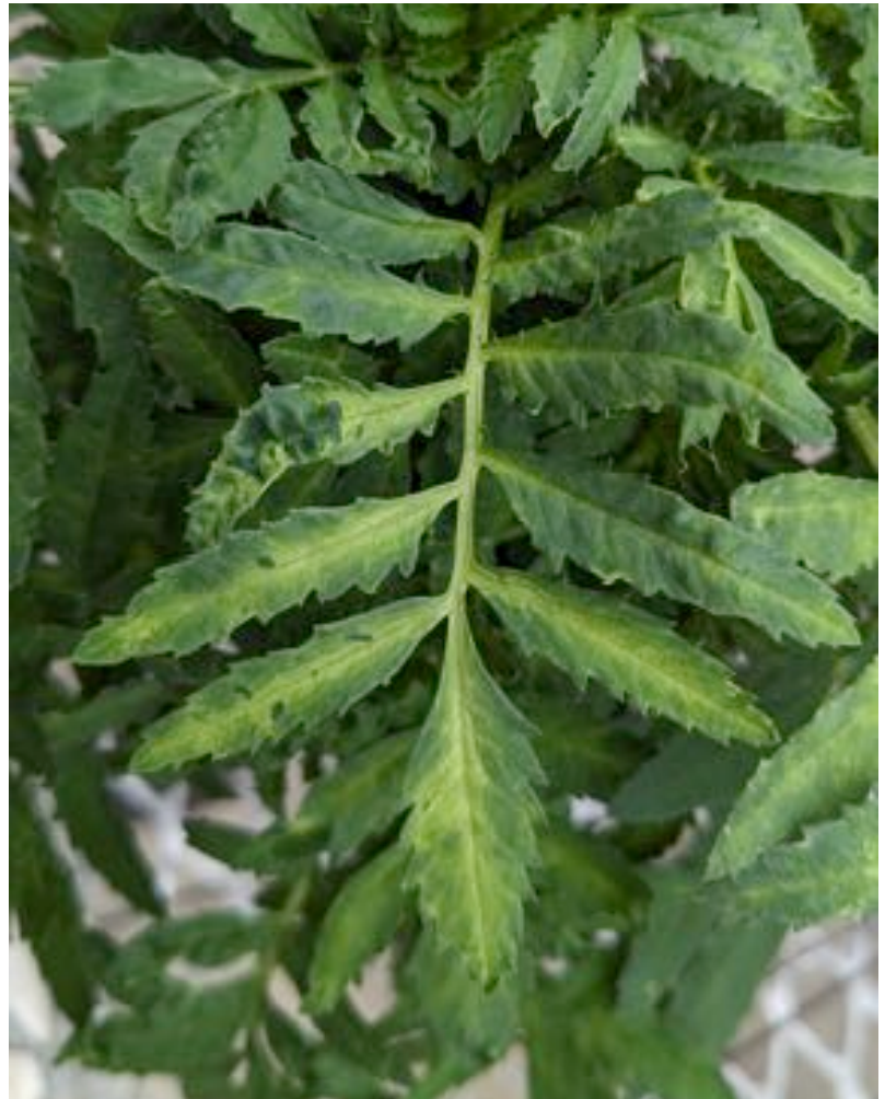
Figure 3. Mottling beginning to develop on the young leaves of marigolds.

Note: With the warmer temperatures, one has to be concerned about Western flower thrips (WFT) in the greenhouse. Our NCSU greenhouses are no exception. We tried to practice a clear-out crop rotation between experiments, and the glass greenhouse with concrete floors had been fallow for 2 weeks before starting an experiment with marigolds. A low population of WFT had been present in the prior crop, with the pressure most likely coming from the next greenhouse compartment even though there is a glass wall and door separating them. The cuttings from a prior crop of New Guinea impatiens that we obtained from a grower had been battling TSWV. None of our plants developed any signs of the virus. We speculate that a plant had TSWV but