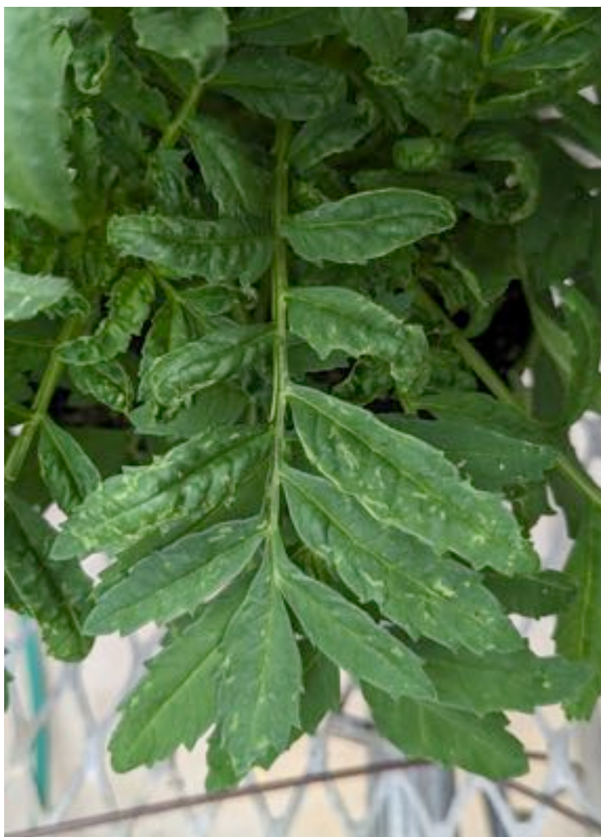
Figure 4. Leaf distortion on marigolds from Western flower thrips feeding.

Robb, K.L. 1989. Analysis of Frankliniella occidentalis (Pergande) as a pest of floricultural crops in California greenhouses. PhD dissertation. Univ. of California-Riverside. pp. 57.