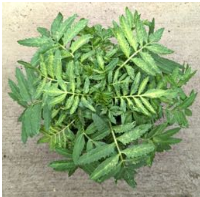
Figure 1. Top view of a marigold plant with tomato spotted wilt virus (TSWV).

White ringspots, leaf mottling, and leaf distortion were observed on a crop of marigolds. These symptoms are typical of what occurs with a virus. This Alert will aid in identification of a tomato spotted wilt virus (TSWV) infection in marigolds.