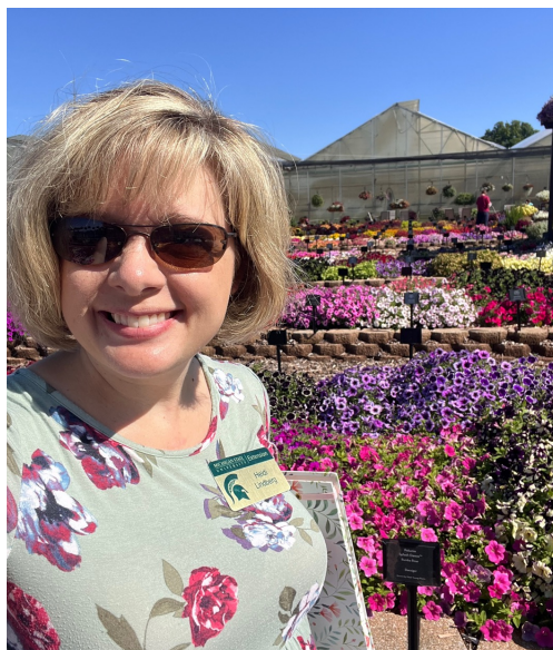
Photo 1. It’s always a good day to visit trial gardens!

Every year Michigan State University and Michigan’s leading young plant producers host a free open house at their trial sites and display gardens to give growers, landscapers, and retail operators the opportunity to learn about a wide range of ornamental crops. Industry professionals can see for themselves which new varieties perform the best under various conditions, including in the ground and in containers. The tour lasts for two weeks and was held this year from July 29-August 9, 2024.