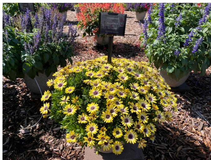
Photo 23. Osteospermum ‘Blue Eyed Beauty’ has a showy, unusual lavender, white and yellow flower.

Another pollinator favorite at the Four Star display gardens that I also admired for its top performance was Aromagica™ Purple Heliotropium arborescens . In addition to being a pollinator magnet, the large, deep purple inflorescences are fragrant and well-branched. Even as some blossoms were passing, new ones were developing right ovetop giving the plant a very clean appearance with little to no maintenance.