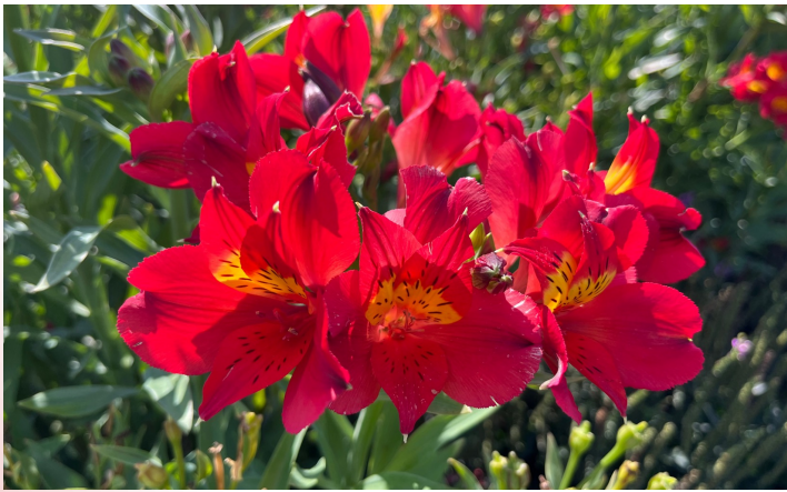
Photo 5. Alstroemeria 'Summer Heat' features fiery red flowers with yellow throats.