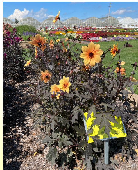
Photo 22. The contrast of the peach blossom of Dahlia Mystic ‘Spirit’ with the deep mahogany foliage, makes it appear even darker in color.