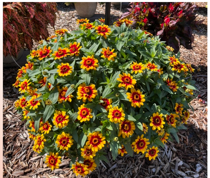
Photo 18. Zinnia Profusion 'Red Yellow Bicolor' atop a healthy mounded habit.