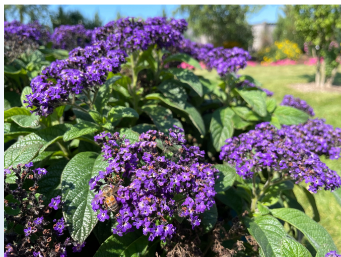
Photo 25. Aromagica™ Purple Heliotropium featured a well-branched habit and tidy appearance.