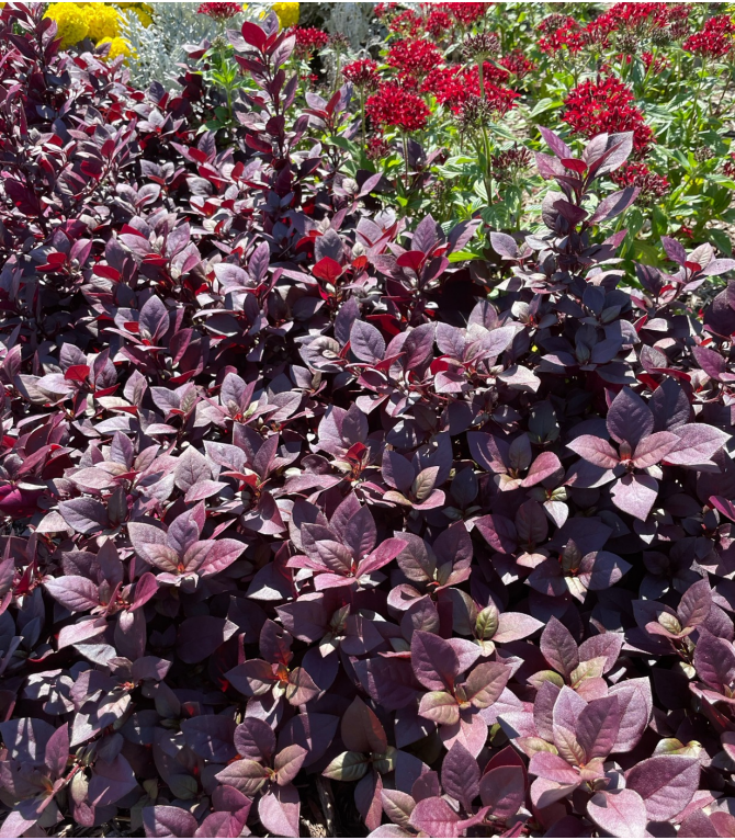
Photo 26. The deep burgundy coloration of Alternanthera 'Purple Prince' creates a tidy border in front of the colorful flowers behind.