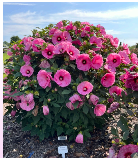
Photo 14. Hibiscus Summerific® 'Candy Crush' features huge 8" flowers on a tidy, but large foliage.