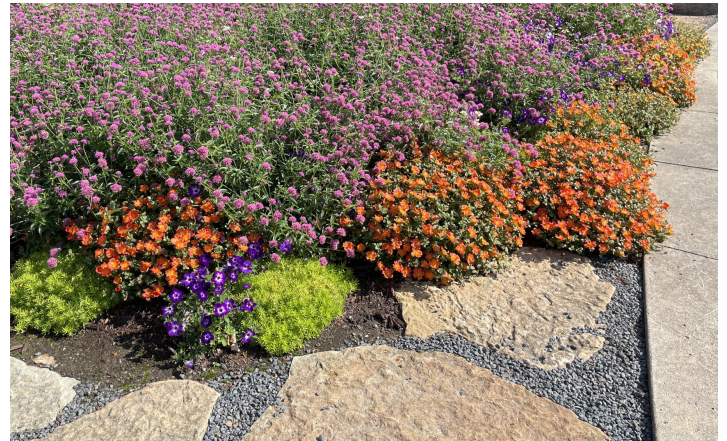
Photo 16. Mojave® Tangerine Portulaca Improved pops amongst the sea of Truffula® Pink Gomphrena behind its flashy border.

Zinnia Profusion 'Red Yellow Bicolor' was the 2021 AAS trial winner and has previously won the Fleuroselect Gold Medal award for performance in European flower trials. While not brand new, 'Red Yellow Bicolor' was a strong contender with its excellent mounding habit and cheery red and yellow flowers at the 2024 trial garden.