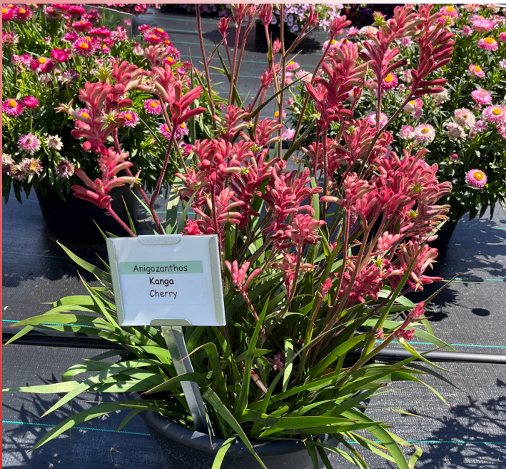
Photo 7. Anigozanthos Kanga 'Cherry' was particularly floriferous.

Those who are familiar with cut flowers in the florist trade will be happy to see that Alstroemeria, or Peruvian lilies, made my list for 2024. Walters Gardens is releasing 3 new varieties in this genus for 2024-2025, all with beautiful flowers. 'Summer Heat' stands 3 to 3.5 feet tall and is a great back of the border variety that attracts pollinators. The flowers are bright red with yellow throats. It added vibrant color to this display bed. It has overwintered multiple seasons in Zone 6 in Zeeland, MI and it blooms mid-summer through frost. It is a great addition to the back of a border garden or an addition to a cut flower garden.