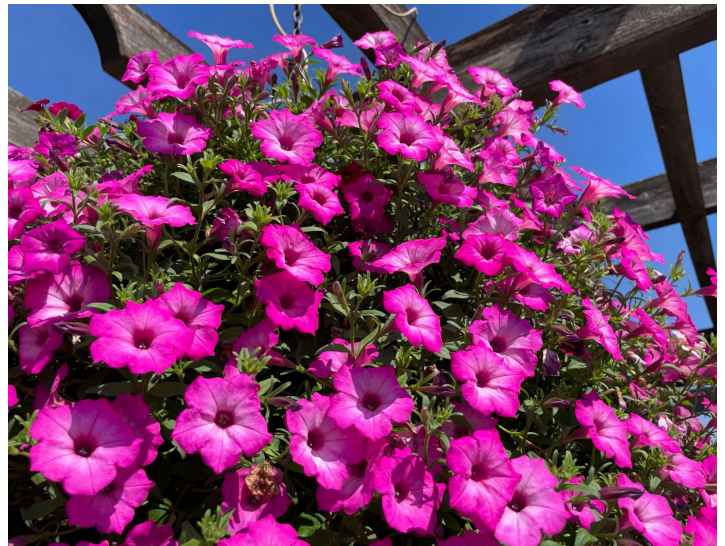
Photo 13. Supertunia 'Tiara Pink' is a vigorous princess pink petunia with a luminescent glow emanating from the center.