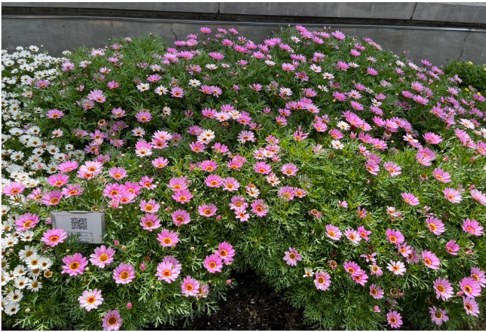
Photo 11. Argyanthemum Grandaisy® 'Pink Halo Improved' created a pink carpet.