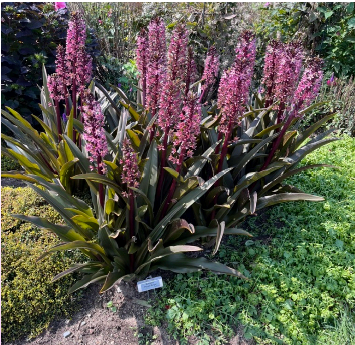
Photo 8. Eucomis 'Purple Reign' has purple spikes of flowers on bronze strappy foliage.