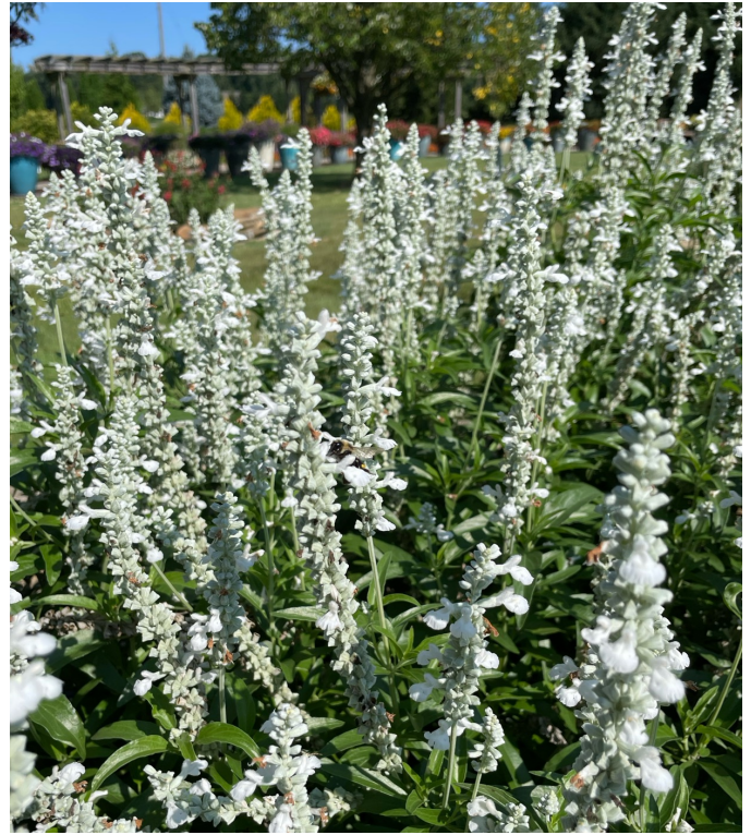
Photo 27. Unplugged® White Salvia covered in bees.