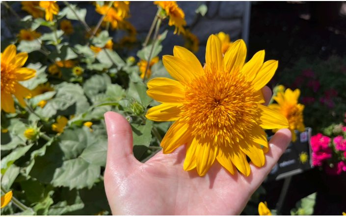
Photo 19. Large double, yellow flowers of Sunfinity® ‘Double Yellow’.