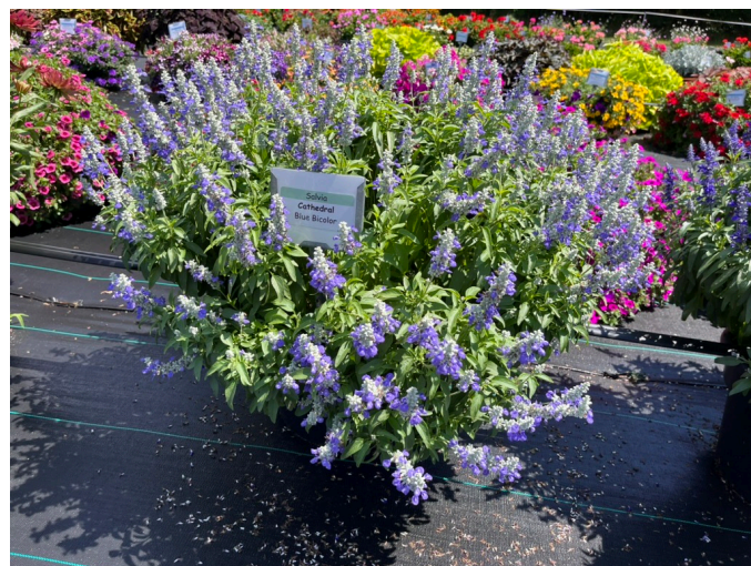
Photo 24. Salvia Cathedral® ‘Blue Bicolor’ with white and purple flowers was a pollinator magnet.