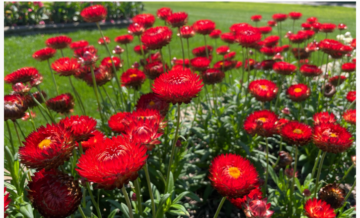
Photo 3. Cheery, red bracts of this supersized strawflower, GRANVIA ‘Crimson Sun’, welcome the day’s bright sunshine.