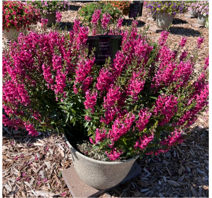
Photo 9. Dozens of flowers on the raspberry Angelonia Archangel 'Dark Rose'.