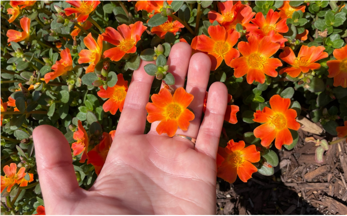
Photo 15. Mojave® Tangerine Portulaca Improved has showy orange flowers with a yellow center.