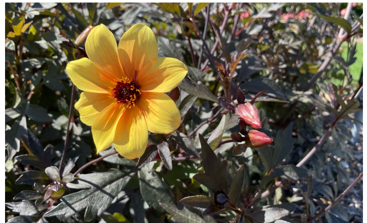
Photo 21. The peach blossoms atop Dahlia Mystic ‘Spirit.’

The bees and I are also fans of single dahlias that retain their pollen-filled centers. Though they often are less showy than their multi-petaled counterparts, Dahlia ‘Mystic Spirit’ from Kientzler gives them a run for their money. The large flowers displaying an eye-catching hue of peachy goodness with a just a touch of rosiness sit atop robust mahogany to black foliage. The blooms are vivid against the dark backdrop of foliage. This variety is a must have for a middle of the border planting or a fashionable container.