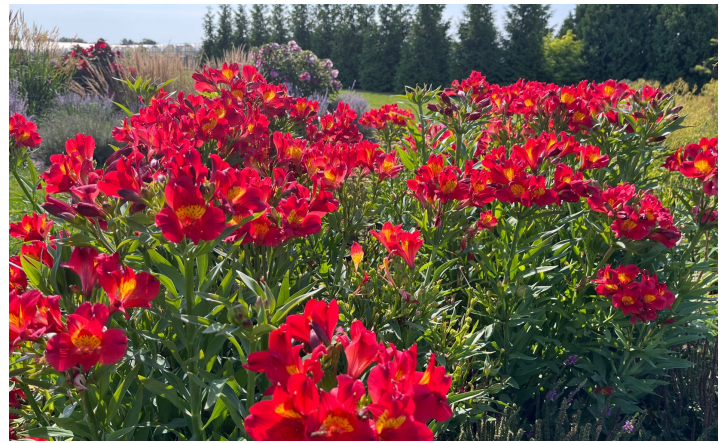
Photo 6. Alstroemeria 'Summer Heat' would be great as a back of the border plant or a central focal point.