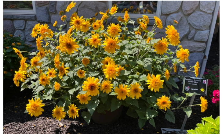
Photo 20. Prolific habit of Sunfinity® ‘Double Yellow.’