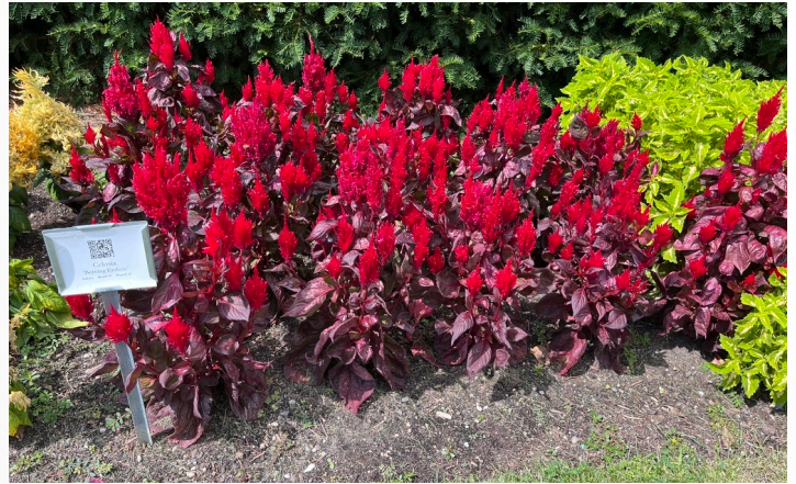
Photo 2. Celosia ‘Burning Embers’ exhibits fiery red flowers on crimson foliage at MSU trial gardens.

I always love a splash of color for the shade and really love tuberous begonias for their large flowers. Both begonia ‘Beaugonia Poppy Peach’ and ‘Beaugonia Poppy Orange’ had showstopping large multi-colored flowers at DGI Propagator’s trial gardens. The peach varieties have bright salmon, peach, and yellow flowers that cascaded over the side of the container in the shade garden. The orange variety was in combination with other plants, but stole the show with vibrant yellow, orange, and red flowers.