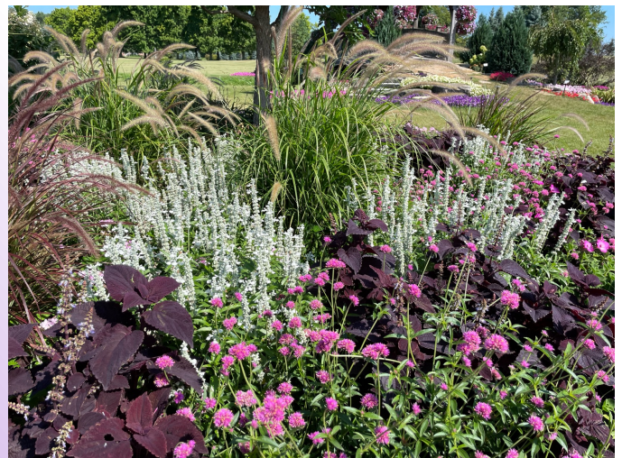
Photo 28. Unplugged® White Salvia alongside best sellers Truffula® Pink Gomphrena, Graceful Grasses® Purple Fountain Grass, and ColorBlaze® Newly Noir™ Coleus.

It's not often that white flowers steal the show, but the new Unplugged® White Salvia was a standout, a favorite of mine and the pollinators. In the display beds it was featured with best sellers Truffula® Pink Gomphrena, Graceful Grasses® Purple Fountain Grass, and ColorBlaze® Newly Noir™ Coleus.