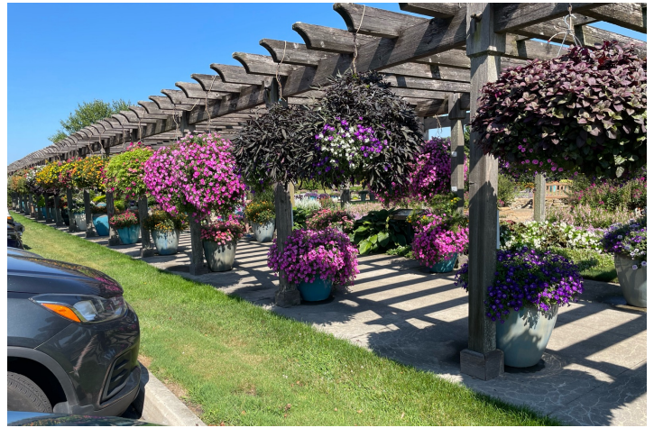
Photo 12. Supertunia 'Tiara Pink' petunia catches my eye from the parking lot.

It wouldn't be a Michigan Garden Plant Tour without choosing a Summerific® hardy hibiscus as a favorite! Walters Gardens has all their varieties of hardy hibiscus planted in a large bed and some in a stunning large border bed across the garden. 'Candy Crush' is not the newest introduction in the series but had showy pink flowers with deep throats in a tidy 5-foot ball-like habit. The sturdy stems held the large flowers upright without flopping over.