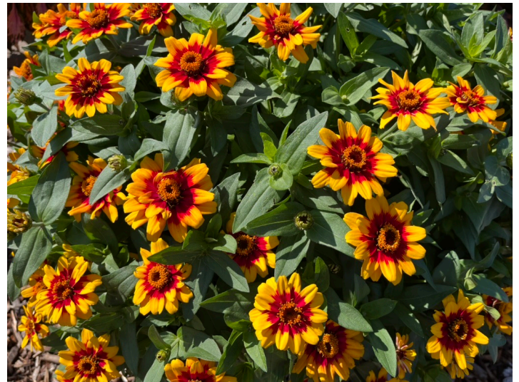
Photo 17. Bright bicolor flowers of zinnia Profusion 'Red Yellow Bicolor.'