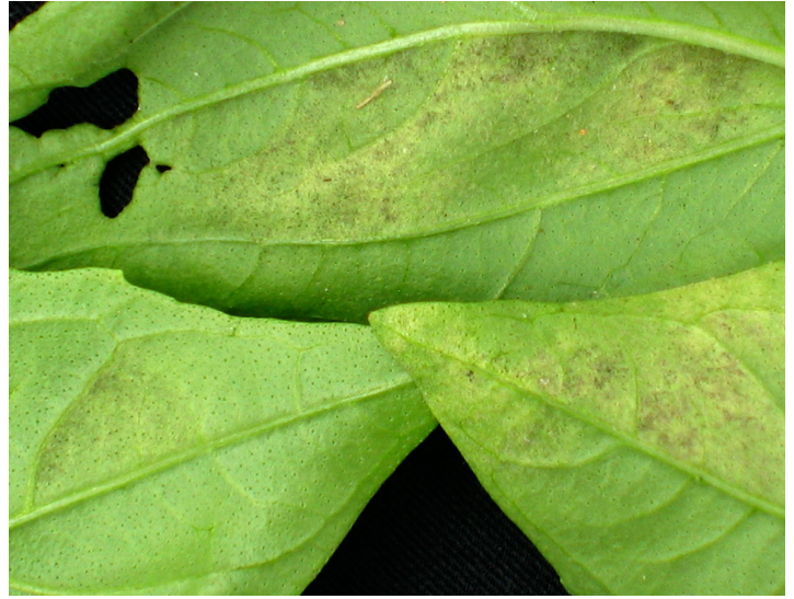
Pathogen growth and spores on lower leaf surfaces.

Devotion, Obsession, Passion, and Thunderstruck are the first resistant varieties released from the Rutgers University basil breeding program. They are marketed by VDF Specialty Seeds. Organically-produced seed is available. Prospera is being marketed as organic seed by Johnny's Selected Seeds. Amazel is a Proven Winners variety, its seed is sterile and thus sold as cuttings. Limited suppression is typical with Eleonora, the first commercially available resistant variety. Emma and Everleaf (aka Basil Pesto Party and M4828Z) also have moderate resistance. Results and photographs from variety evaluations conducted at Cornell are available on-line at http://blogs.cornell.edu/livegpath/research/basil-downy-mildew/ .