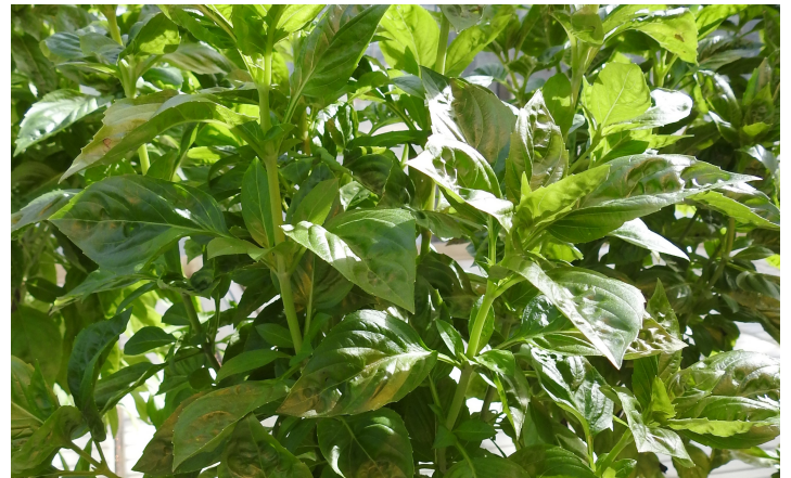
Obsession exhibiting very good resistance contrasting with Martina (at bottom).

Heritage (azoxystrobin; FRAC 11), Micora (mandipropamid; FRAC 40), Segovis (oxathiapiprolin; FRAC U15), and Subdue MAXX (mefenoxam; FRAC 4) are additional fungicides that can be used in greenhouse-grown plants for retail sale to consumers. Subdue MAXX and Segovis use are on supplemental labels available in the CDMS database, http://www.cdms.net/LabelsSDS/home/ ; supplemental labels can also be found on manufacturers' websites (and, for those of you in NY, the NYS Pesticide database http://www.dec.ny.gov/nyspad ). Subdue can be applied once to plug-production trays after seeding and before seedling emergence and once after plugs are transplanted to larger pots; it must be tank-mixed with another fungicide labeled for this use. Heritage can similarly be applied only once at each production stage but both applications are to foliage and it must be applied in alternation with another fungicide. Micora and Segovis can only be applied to foliage of plants for retail sale as transplants; they are not permitted used on plants to be marketed as fresh herbs in grocery stores. Both can be applied at most twice to a crop. According to label directions, Micora can only be used in an enclosed