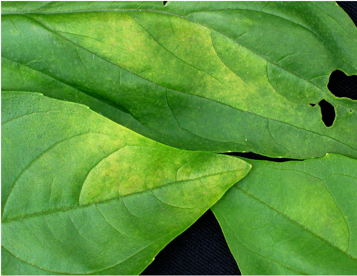
Yellowing on upper leaf surfaces.